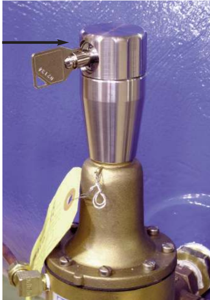
X140-1 Locking Security Cap