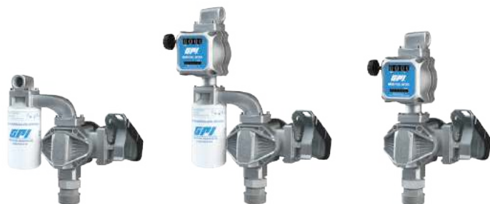
G20 with Filter Kit