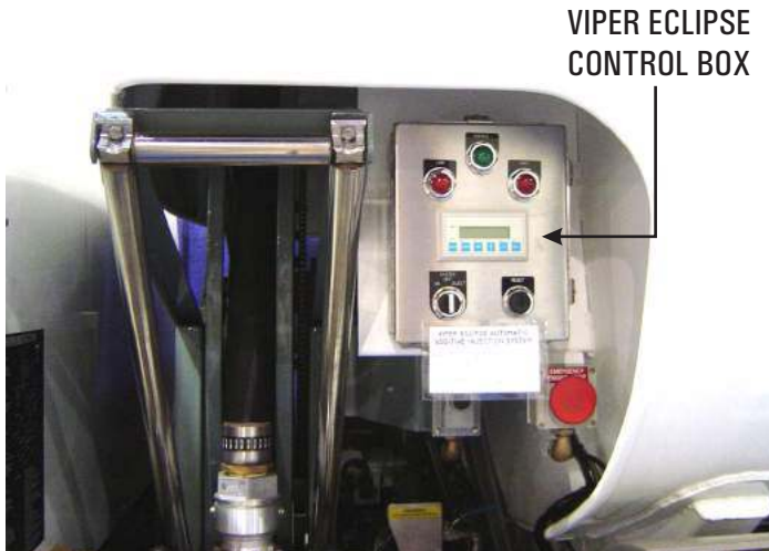
VIPER ECLIPSE CONTROL BOX

Self-Monitoring, Self-Adjusting - "Eclipses" so-called "Smart" systems that only alert you when they fail.